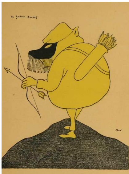
Beerbohm, Max. The Yellow Dwarf . 1896. Ink on paper. The Yellow Book 11 (Oct. 1896): 7.

With fourteen realistic short stories or sentimental romances to his credit, as well as three satirical essays under the pen name “The Yellow Dwarf,” Harland was the only author who contributed at least one story or article to each volume of The Yellow Book .